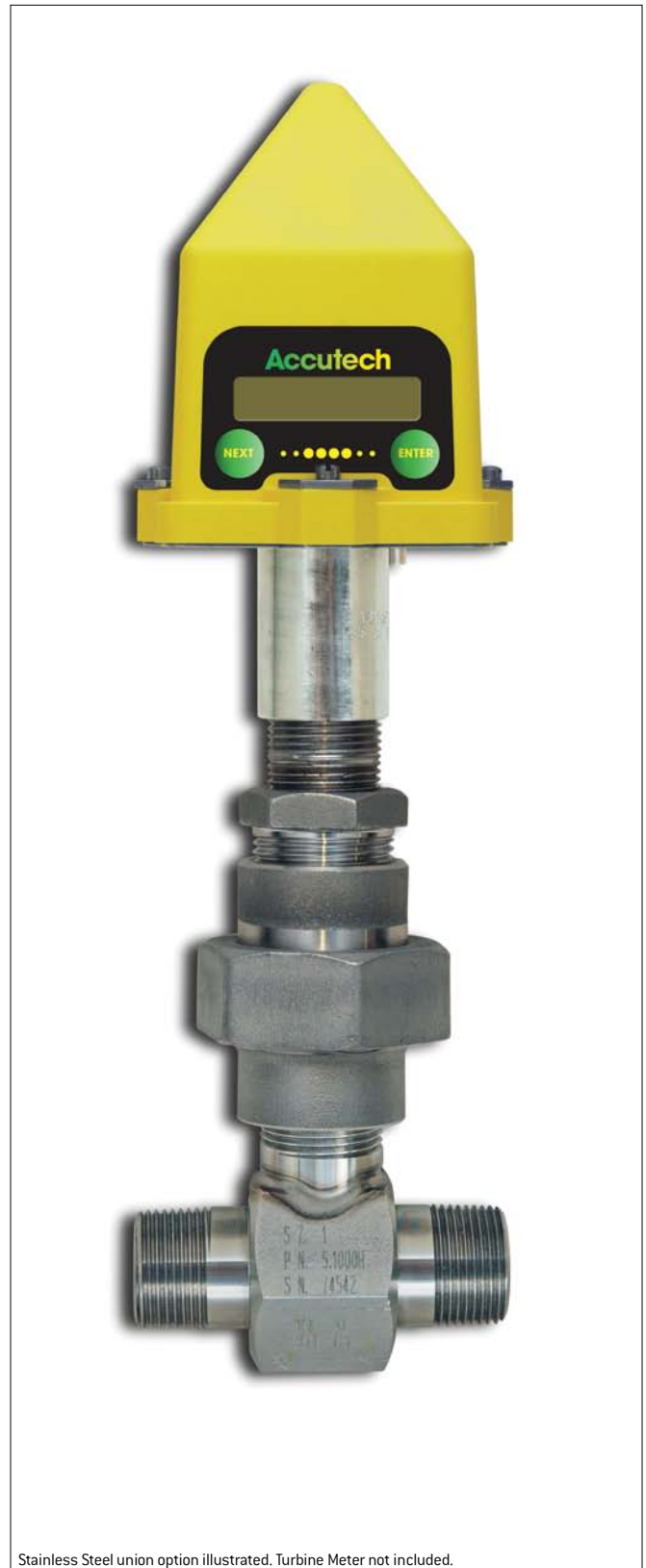
Stainless Steel union option illustrated. Turbine Meter not included.

All Accutech field units automatically report field data to a centralized Accutech base radio over distances of up to 5000ft (1524m). Each field unit is self contained, featuring an integrated 900MHz (license-free band), frequency hopping, spread-spectrum transceiver and antenna, and long-lasting battery for up to 10 years of maintenance-free operation. Accutech field units are housed within a compact and weather-proof NEMA 4 enclosure with options for a NEMA 4X or explosion-proof enclosure, remote sensor and remote antenna on select models. Field units are available in a wide range of certifications and are protected by an industry-leading 3-Year warranty (parts and labor).